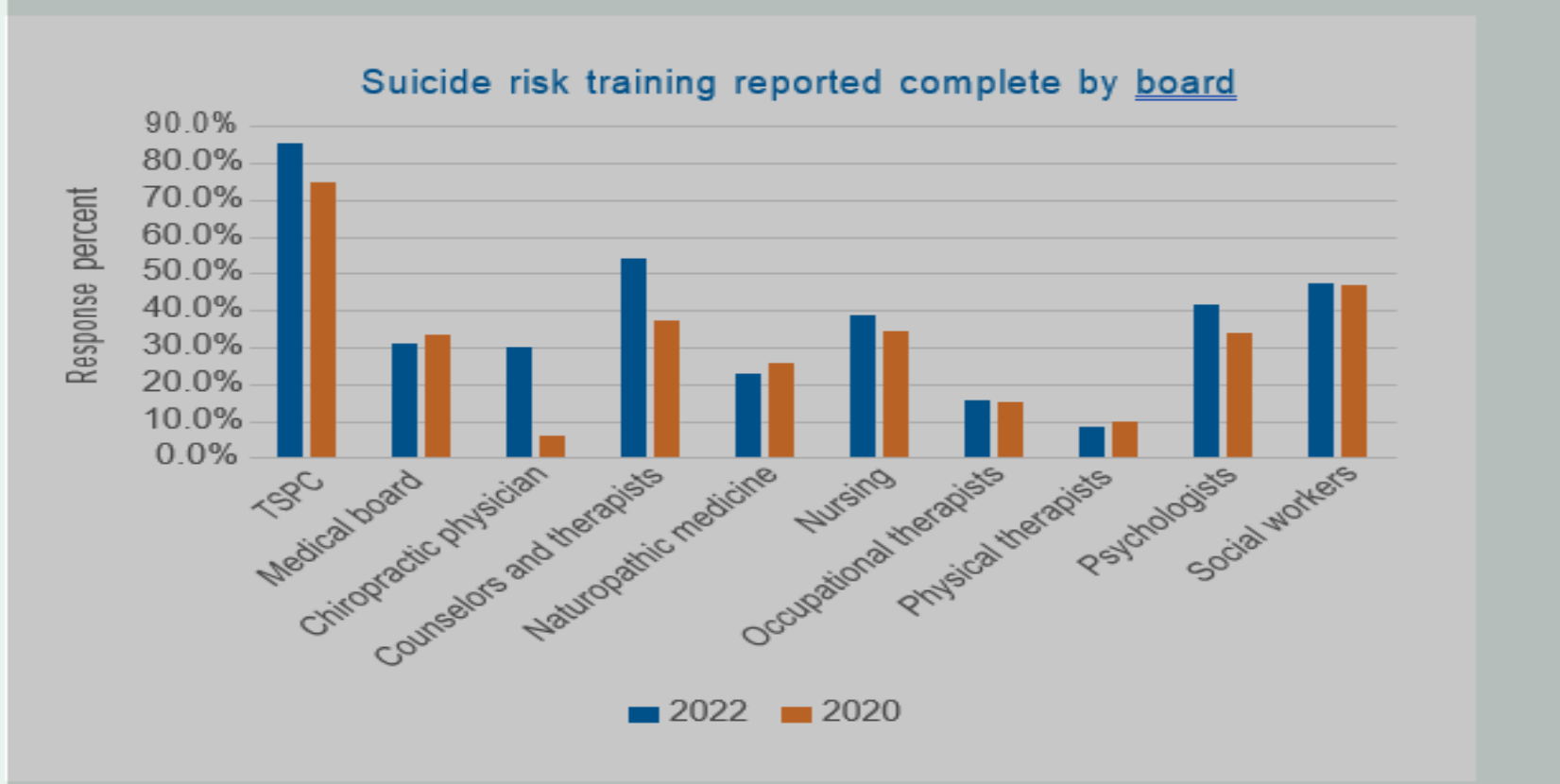
Figure 4: Percentage comparisons of licensees reporting completion of continued education in suicide risk assessment, treatment, or management by licensing board in 2022 and 2020.

relevant course in 2020 (6.1%), they reported the largest increase during the 2022 (30.2%) reporting period.