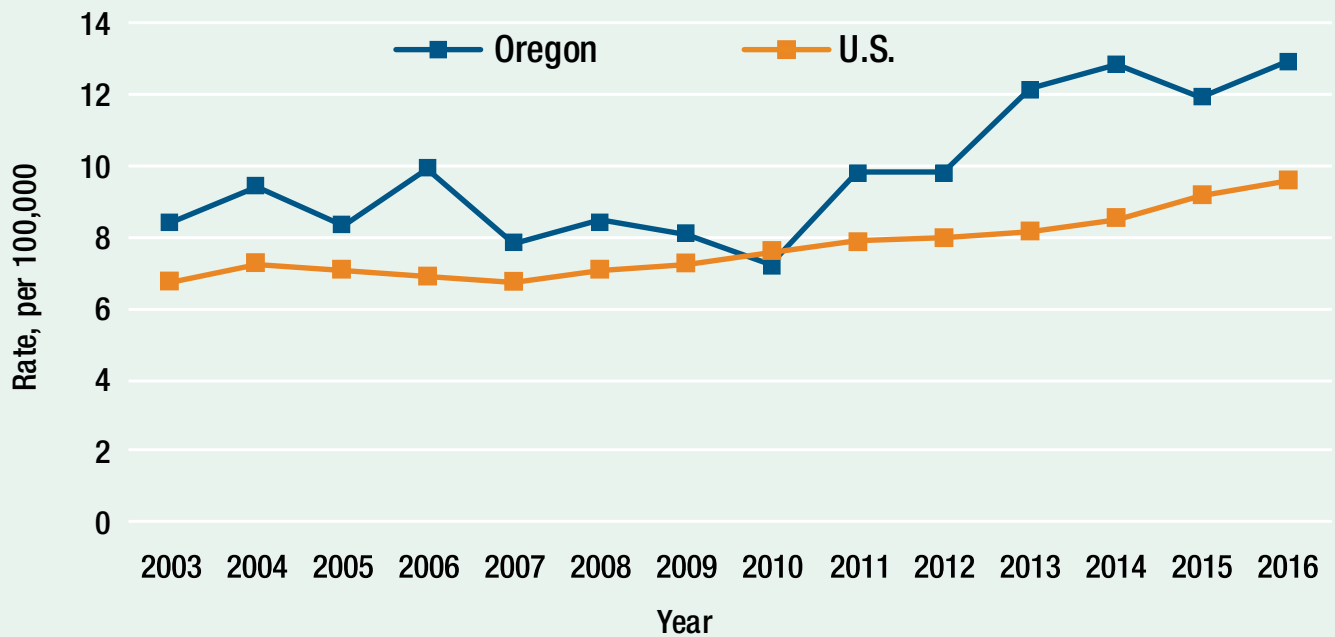
Table 1. Comparison of suicide completion rates per 100,000, among youth aged 10 to 24 years in Oregon and the U.S., 2003-2016(1)(2)*